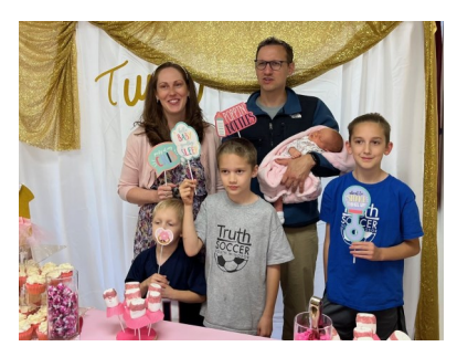
The growing Strouse family poses for a photo op.