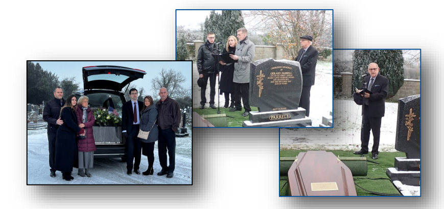
The Funeral Service can be viewed by accessing the following link : <u>https://reillysfuneralhome.ie/live-stream/</u>